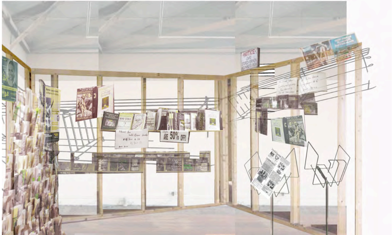
Enjoy Public Art Gallery, Wellington, New Zealand, 2010