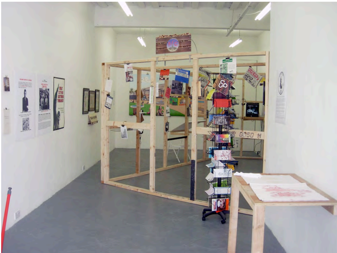
Gallery 126, Galway, Ireland, 2012