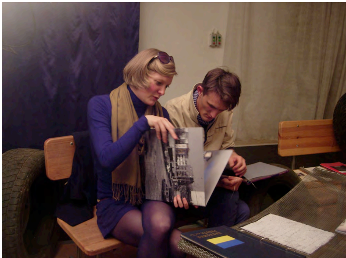
Las Kurbas Center, Kiev Ukraine, 2014