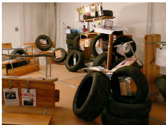
Mockup of Imaginary Archie Philly for Institute of Contemporary Art, February 2014