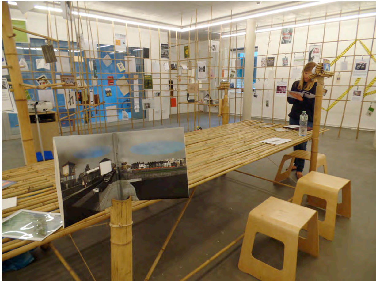
Zeppelin University, Friedrichshafen, Germany, Sept – Nov. 2015