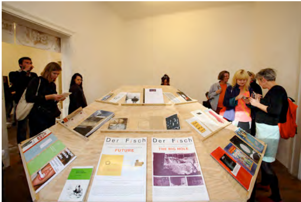
Imaginary Archive at <rotor> Center for Contemporary Art, Graz, Austria, 2013